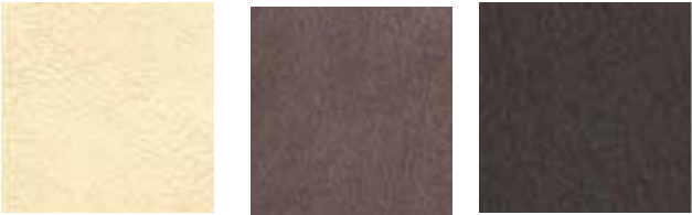
Cream Brown Black