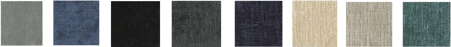
Silver Grey Blue Black Charcoal Purple Natural Stone Teal