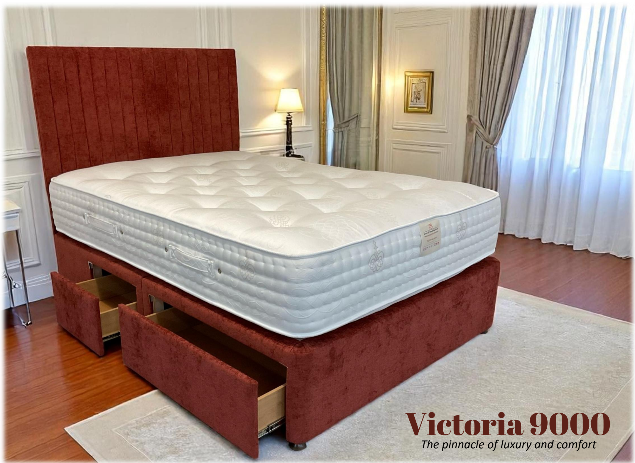
Victoria 9000 The pinnacle of luxury and comfort