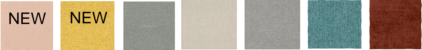
Sonata Primrose Sonata Sunflower Sonata Smoke Garda Linen Garda Storm Ferraro Teal Fireside